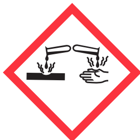
CONTAINS CHROMIUM (VI)

DANGER Causes skin irritation. Harmful if swallowed. Causes serious eye damage. May cause respiratory irritation. Keep out of reach of children. Avoid breathing dust. Wear protective gloves and eye protection. Wash hands thoroughly after handling. IF SKIN IRRITATION OCCURS: Get medical advice/attention. IF SWALLOWED: Call a poison centre or doctor/physician if you feel unwell. IF IN EYES: Rinse cautiously with water for several minutes. Remove contact lenses, if present and easy to do. Continue rinsing. Immediately call a poison centre or doctor/physician. Dispose of contents/container in accordance with local/regional regulations. Repeated exposure may cause skin dryness and cracking. CONTAINS CHROMIUM (VI) May produce an allergic reaction. To avoid risks to human health and the environment, comply with instructions for use. Safety data sheet available on request.